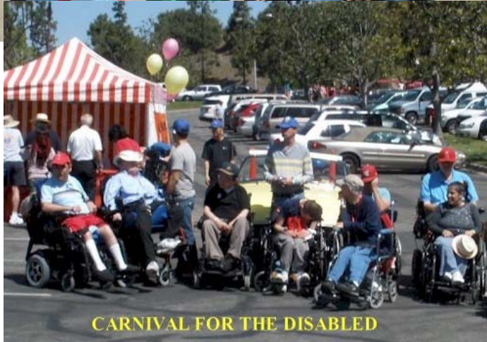
CARNIVAL FOR THE DISABLED