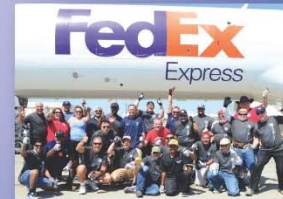
Special Olympics Plane Pull

Thank You Knights of Columbus for Supporting Us