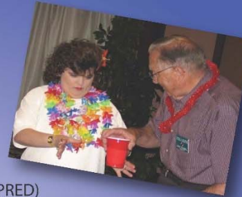
Special Religious Development (SPRED)

HELPING PEOPLE WITH INTELLECTUAL DISABILITIES KNIGHTS OF COLUMBUS