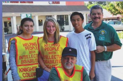
Intellectual Disabilities Drive

Your donations supported over 170 programs throughout California