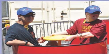
Day of Sharing

Special Olympics St Madeleine Sophies Center Schelby School Noah Homes