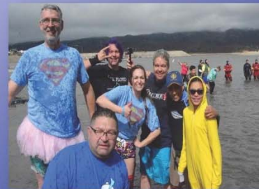
Special Olympics Polar Plunge

Frank Nigro Columbian Foundation Supporting People with Intellectual Disabilities